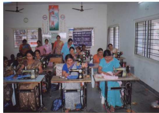
Technical Training in progress