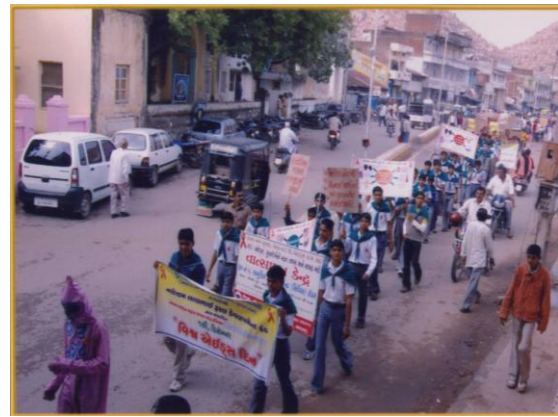
Rally on world Aids Day at Idar