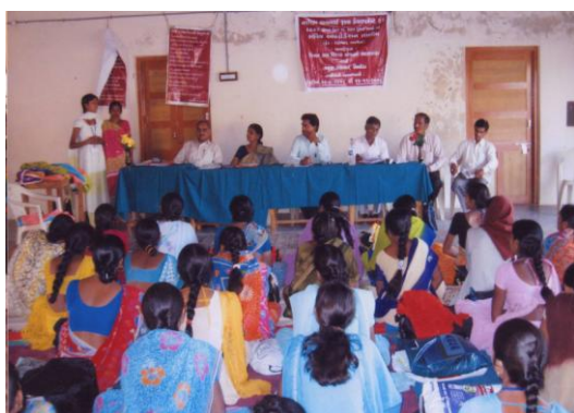
Inaugural session of certificate and stipend distribution to participants at Bhiloda