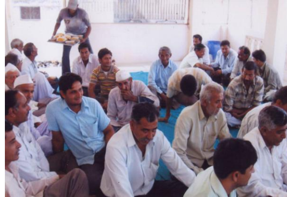
Farmers attending the session at Chhala