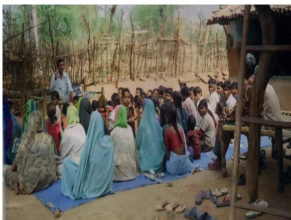
Participants attending the session

Every month street meetings are being conducted on RCH activities at 9 villages of Khedbrahma block. Information on health is being provided to pregnant women, children and parents.