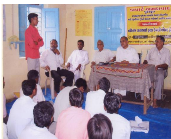
Feedback from Trainee