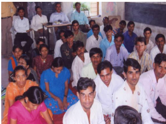
Group photo of link workers at Diodar