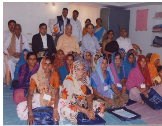
Group Photo of widows with Director, SDD, Gandhinagar