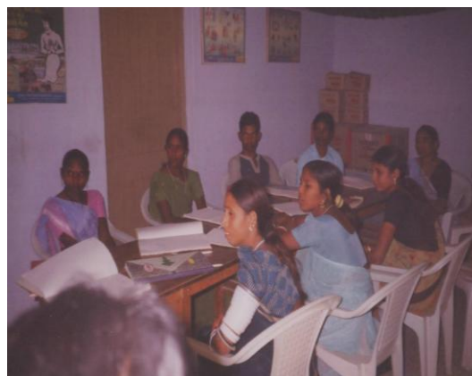
Participants keenly lending their ears