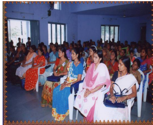
Inaugural session of certificate distribution to trainee widow