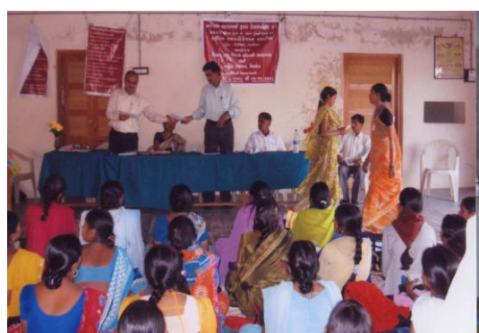
Certificate distribution by T.D.O. Bhiloda