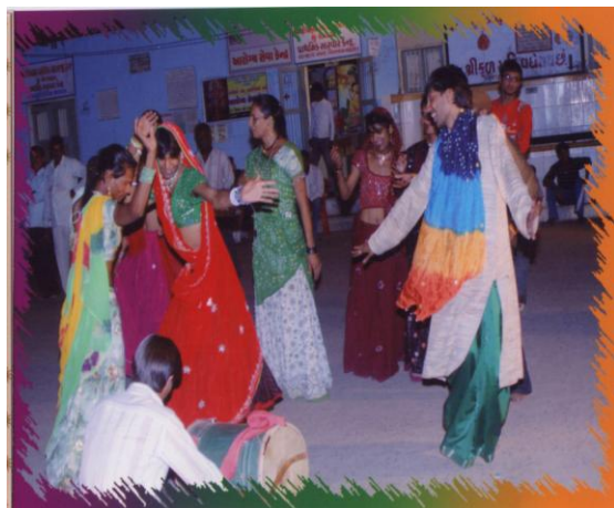
Cultural program in progress