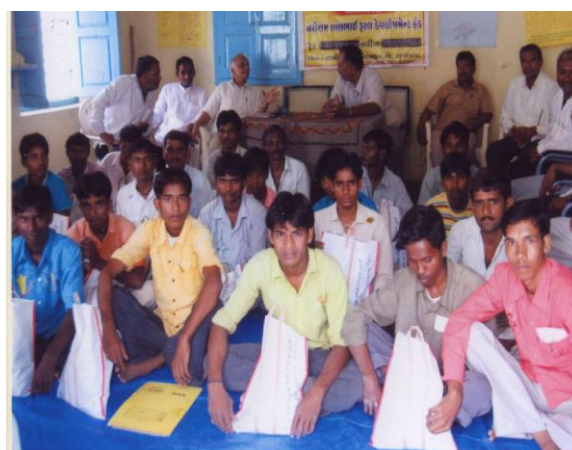
Kit Distribution to mason trainees