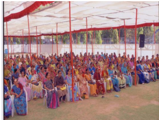
Function of kit distribution to widow by guests at Bapunagar, Ahmedabad.