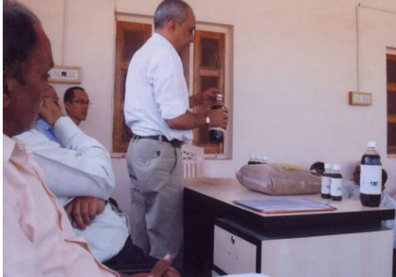
Demo of EM by representative

an awareness meeting of farmers of Chhala village of Gandhinagar district was made on 14/12/2008. Information and importance on Effective Microorganism were provided to farmers. How EM would be effective has been informed to the farmers. Then after on experiment basis 10 progressive farmers were being selected to implement EM on their cattle. Experiment was made for a period of one month on cattle. After a month it is observed there is a 10 % increase of milk given by cattle. And directly 10 % more income by selling that milk. It was also found that organic manure also helps farmers to increase their crop productivity in terms of quality as well as quantity.