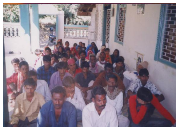
Participant attending the session