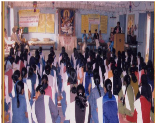
Participants keenly listening to the trainer