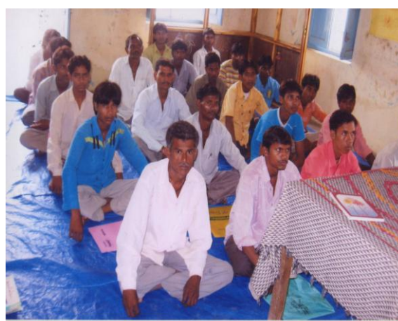
Valedictory Function of Mason Training at Laxmipura