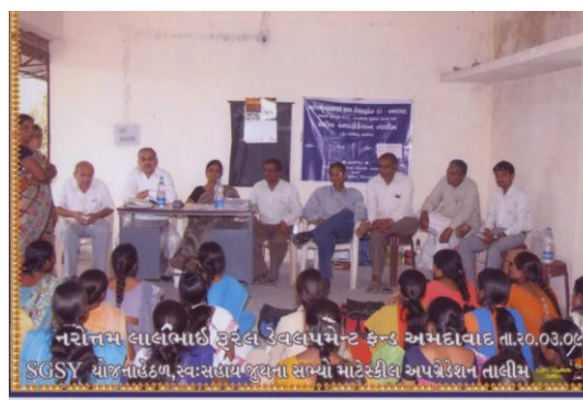
Certificate distribution by Officers of NLRDF & Taluka Panchayat Prantij.