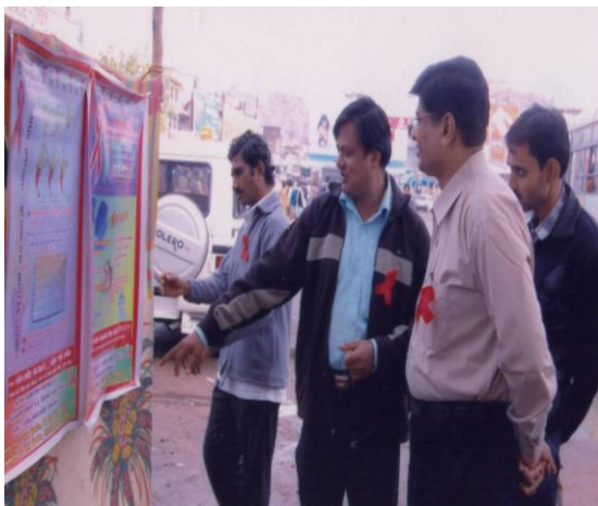
Visit of Dy. Collector at exhibition, Idar.