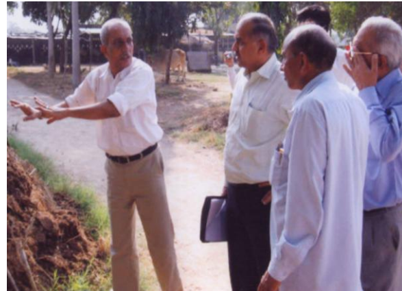
Demo of compost Manure