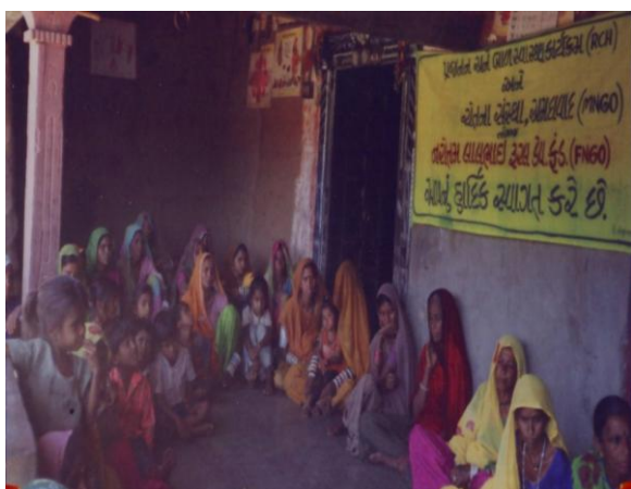
Training course on Health in progress