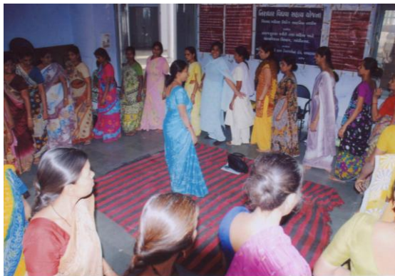
Session on Micro lab in progress.