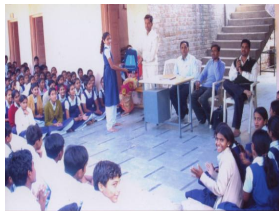
Prize distribution after competition