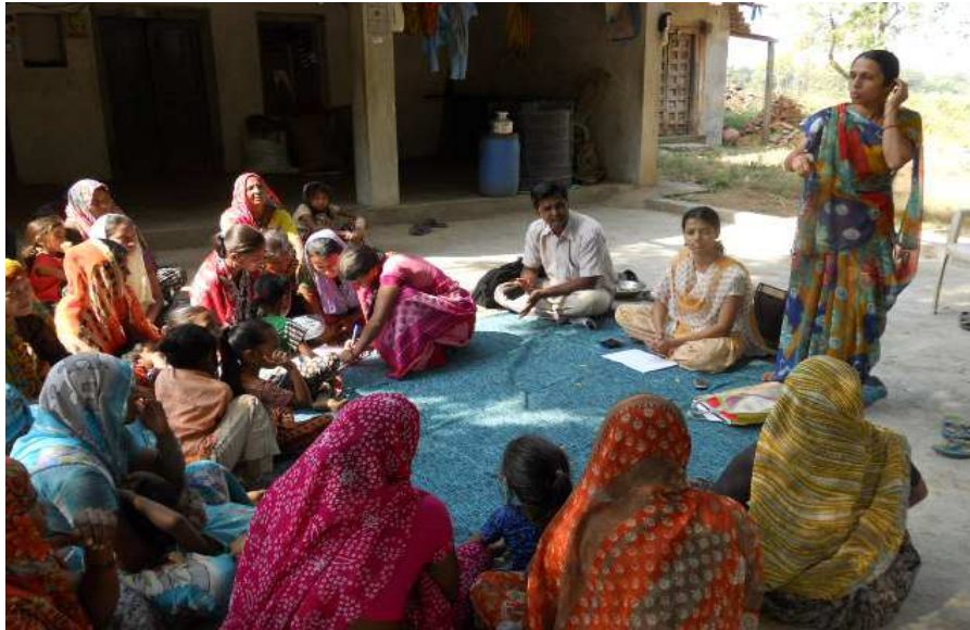
Awareness Meeting with Tribal Women

After CHETNA supported programme is over, NLRDF initiated and continued the programme by its own fund in Khedbrahma Taluka of Sabarkantha District. NLRDF planned a survey in 18 villages of Matoda PHC. In this survey, 10 to 19 years of age group of