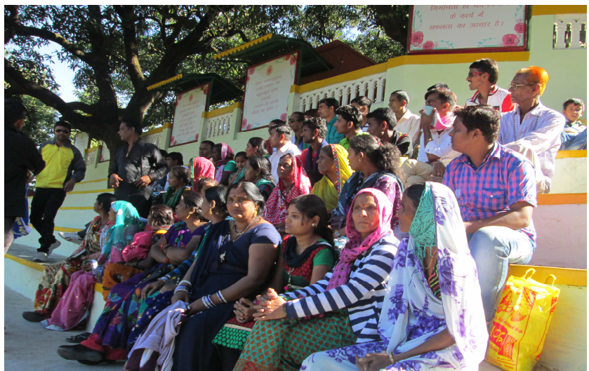
Exposure Tour of KP

held where VULNERABLE WOMENs and MSMs were gathered. The organization identified 20 such places. Regular PE review meetings were held in which status of their works are discussed, and through these meetings gaps are analyzed and efforts are made to minimize the