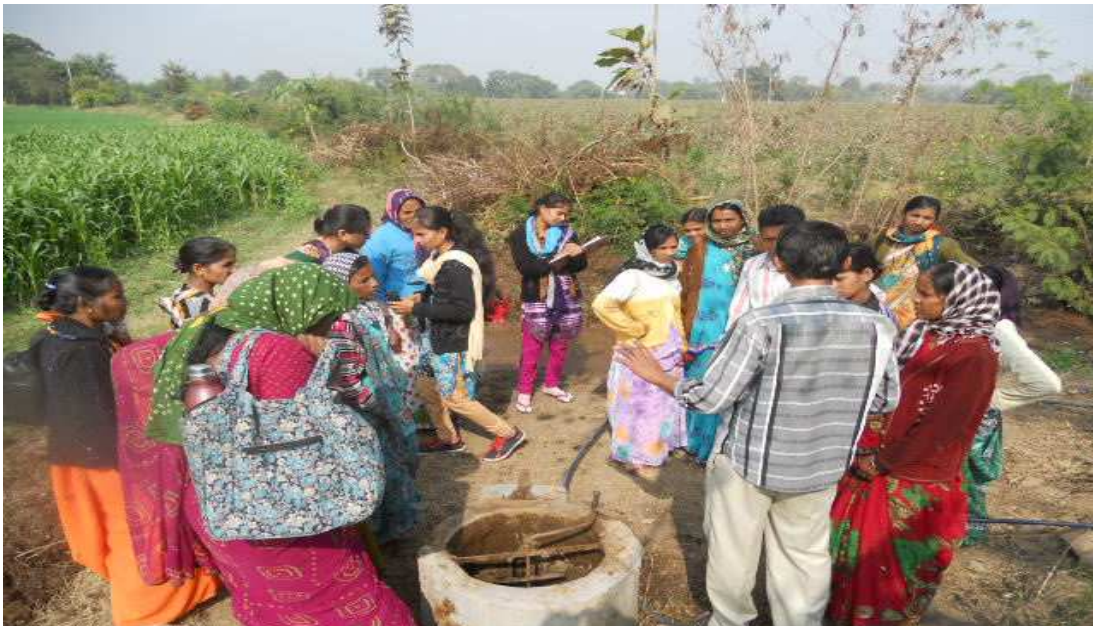
On site visit of Bio gas plant

exposure visit of 39 SHGs women of VIKSAT NGO, Bhiloda was planned in NLRDF's operational area the villages of Vartol and Galodia of Khedbrahma Taluka. During the visit women learnt about the process of biogas. They also understood that today in the world particularly in the rural areas, people cook on open fire and much of this work is done by women who are also often responsible for a constant supply of wood and other fuels. While cooking they inhale the fumes from fires that badly affect their health and general wellbeing. The burning of biomass not only affect human health but also contribute to carbon dioxide emission with harmful impact on the environment.