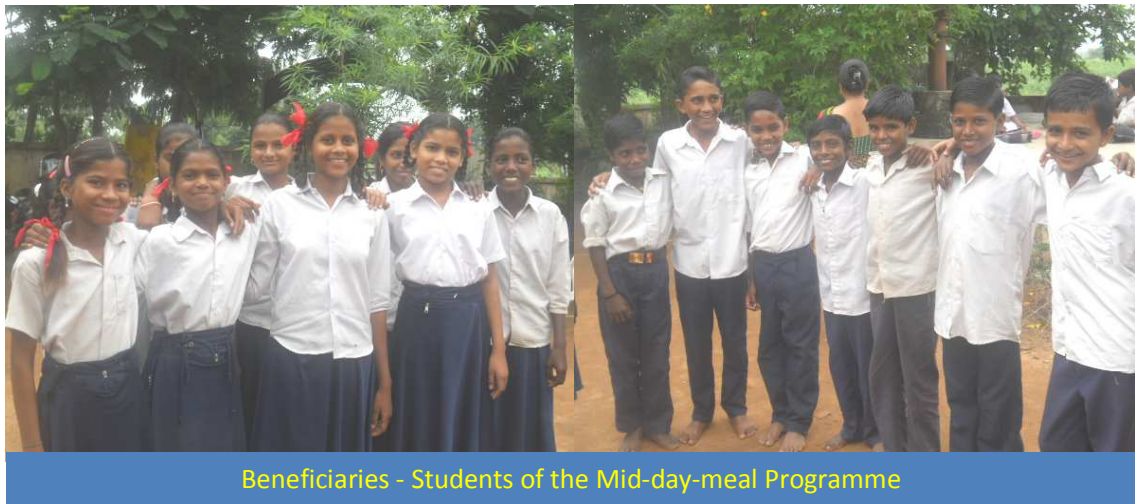
Beneficiaries - Students of the Mid-day-meal Programme