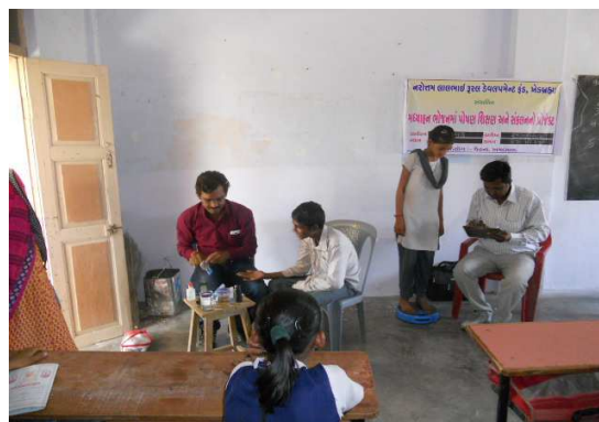
Health Checkup of students

Nutrition Support to Primary Education popularly referred to as Mid-day meal programme (MDM) is considered as one of the means of promoting higher enrolment, school attendance and retention. Simultaneously, it may improve the nutritional status of primary school children. With children from all castes and communities eating together, it is also a step towards bringing about