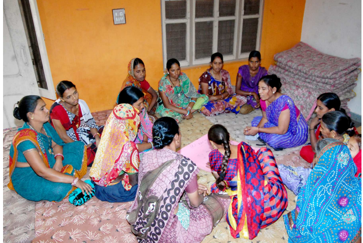
Self Help Group members Meeting

It has been observed that in the society, women's role is very restricted to daily routine, and thus contribution of women to the micro-economy is ignored. This vulnerable situation in the society has made the status of women depressed. This reality of arena has encouraged NLRDF to promote empowerment of women through SHG and microfinance with the integrated approach in its operational areas. In order to ignite negotiating power and develop collective strength among women, NLRDF believes in organising