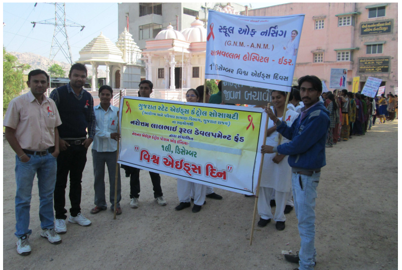
World Aids day Celebration

The organization holds advocacy meetings and celebrates world AIDS day on 1 st December. The purpose of celebrating the day is to generate and disseminate awareness on HIV / AIDS. The activities like rally, exhibition