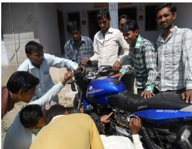
Practical Training to Motor cycle Repairing