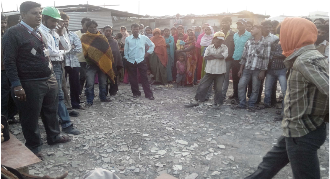
Awareness Meeting with Migrant Population

There are many migrants workers in Dahej Industrial Area. They are from Bihar, Rajasthan, MP. Punjab, Orissa and other districts of Gujarat. They are of the age group of 18-49 years. Their literacy level is low. Due to high unemployment in their native places, they migrate to Dahej industrial zone. They are earning 8000 to 15000 per month. They either live at their working place or at rental place with co workers. They visit to their family annual/biannual at their native place. They spend 10 to 12 hours in their work place. More money and staying away from family make them vulnerable to indulge into high risk activities.