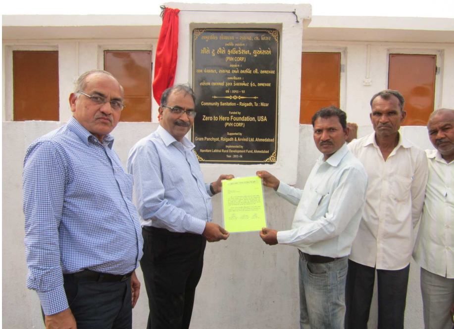
Handing over block to Village committee

of Tapi District for local community. Nizar is very backward taluka in Gujarat and is on the border of Maharashtra. Several awareness programmes on health and hygiene were