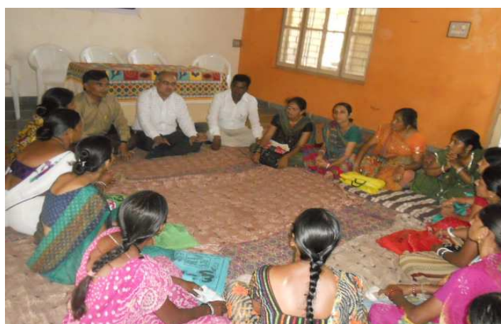
Meeting with Link workers