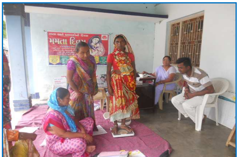
Health Checkup of Women

Under this programme, NLRDF organized training programmes for adolescent girls on nutrition awareness, personal hygiene and health care. All these girls were covered by supplementary nutrition and micronutrient benefits and also provided nutritious food. The girls who were identified under the age group of 10 to 19 years were given vaccine, tablets of iron folic acid and other health related assistance services timely.