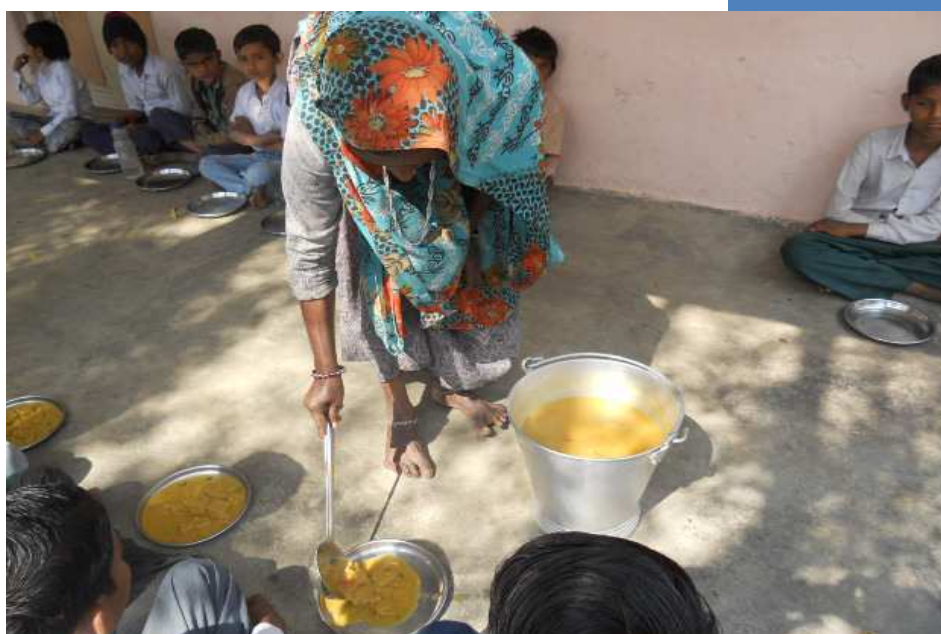
Mid-day meal services to students in school