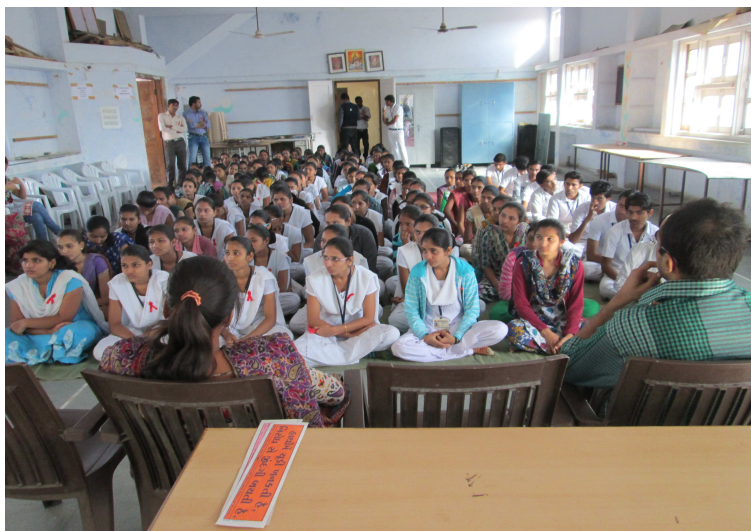
World Aids day Celebration

held. The organization also held meetings with 45 students of nursing school. Every year 2 days PE trainings are held to strengthen their skills and learning. And organization also has prepared a panel of 8 doctors. These doctors are given trainings by STRC-CORT on different issues of HIV / AIDS including treating VULNERABLE WOMENs and MSMs. KPs are