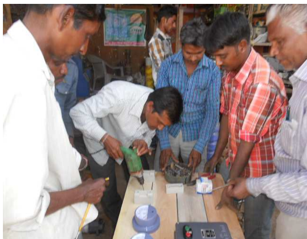
Practical Training of Electrical wiring

Enterpreneurship Development Programmes were conducted in the village Kalol and Khedbrahma. Initially meetings were organized with the youths and had discussion with them about their needs. Based on these meetings, training programme was planned and implemented. During the training participants learnt theories and practical. At end of the training all the participants were given participation certificates.