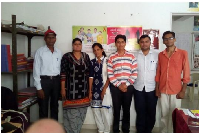
AIDS Control Programme Team, IDAR - Sabarkantha