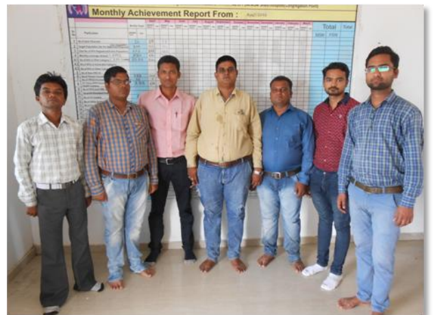
AIDS Control Programme Team, Dahej-Bharuch