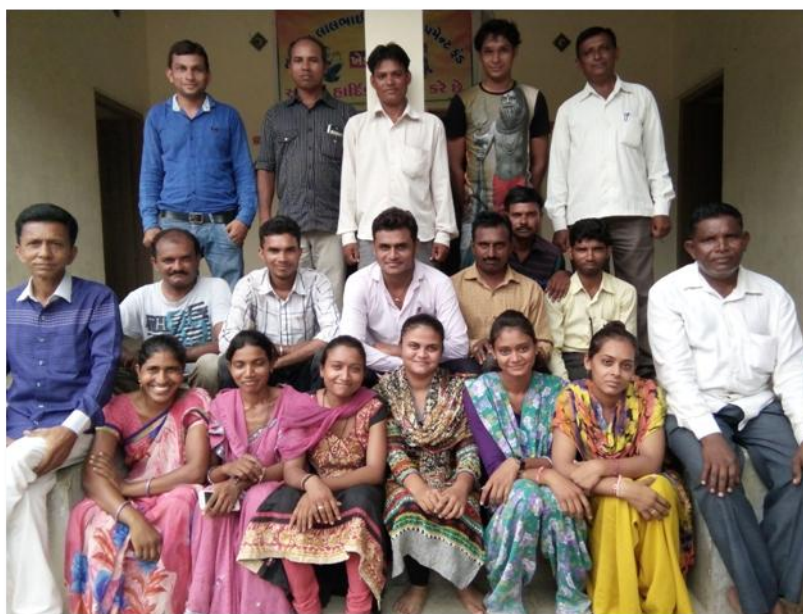
Mother Infant and Young Child Nutrition Project & Farmers Producer Org. Project Team, Khedbhrahma, Sabarkantha